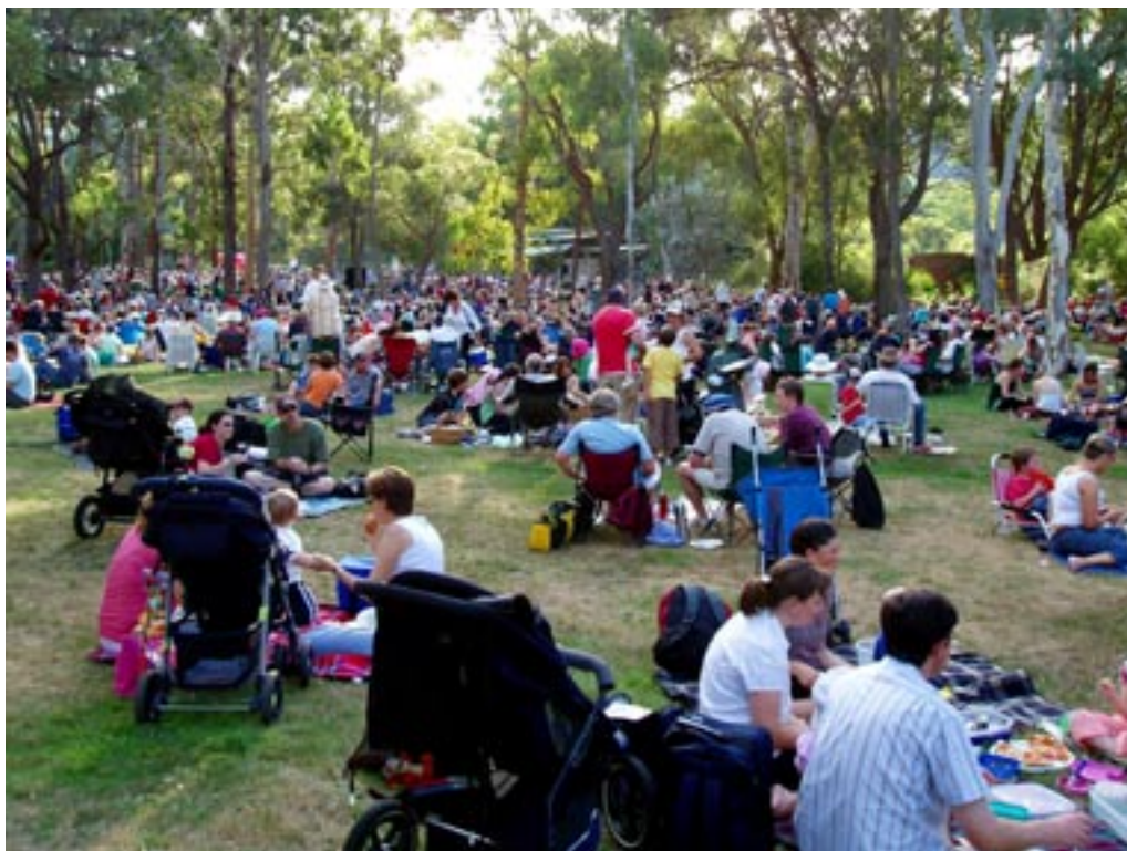
Eucalypt lawn, ANBG

The concerts are presented as gold coin donation events, and monies are collected by a team of volunteers from the Friends' group. Proceeds are also raised from the sale of wine, beer and soft drinks.