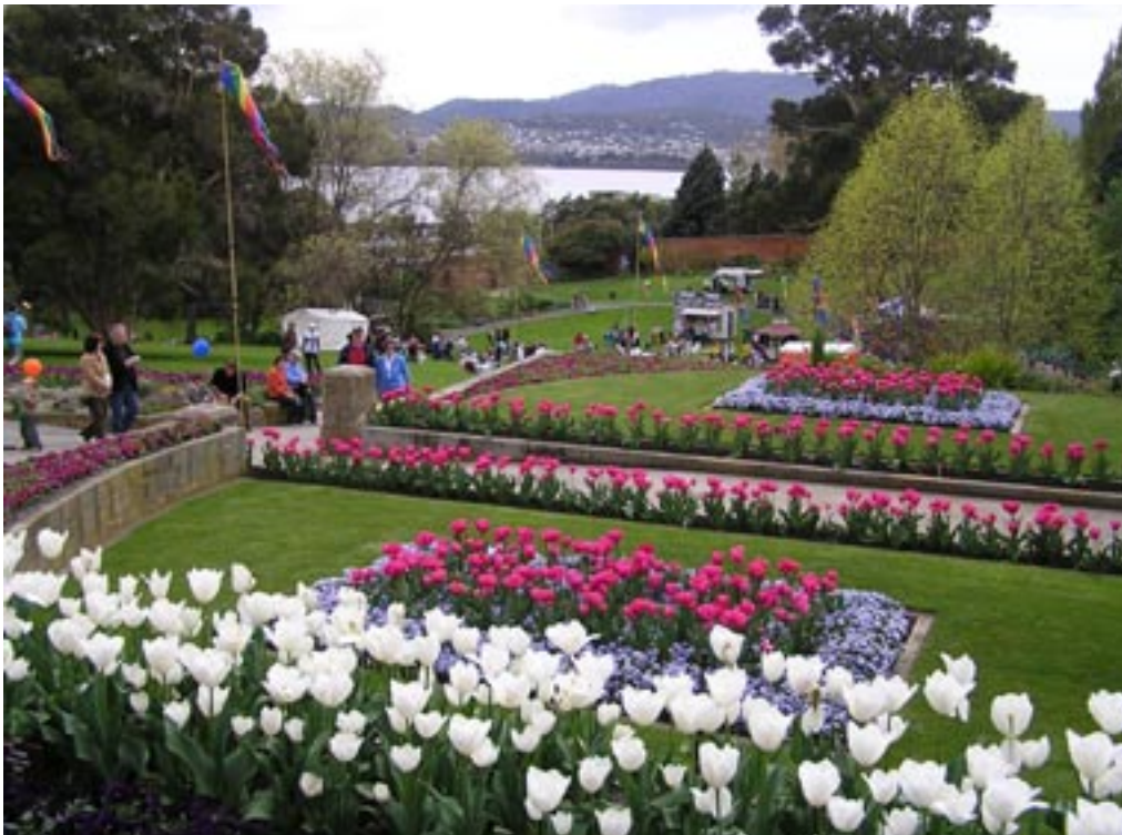
top: Tulip Festival

More recent times have witnessed the development of the Tulip Festival which has grown in 20 years from a modest event initiated by the local Dutch community to southern Tasmania's premiere spring celebration. Held each October, the event attracts thousands to its mix of flowers, international food stalls, multicultural music and performances, children's activities, plant sales and demonstrations.