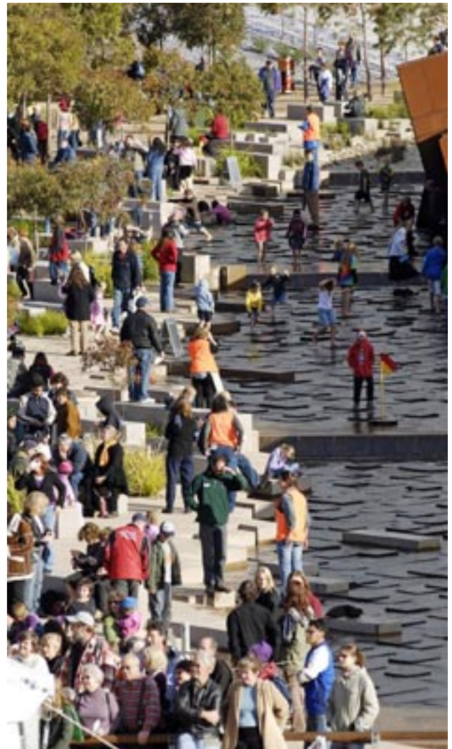
Crowds filled the Rockpool Waterway

"The design of this new botanic garden on a 360 ha site south-east of Melbourne challenges preconceptions of what a botanic garden should be, elevating the notion of floral displays to those of whole ecosystems, underlying soil and water systems manifest and inspiring further exploration." Jury Citation. AILA 1998 National Award for Masterplanning.