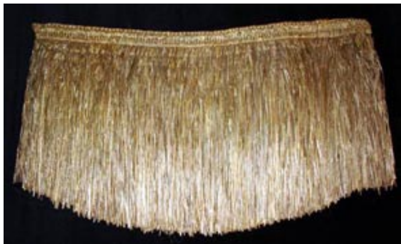
Korowai/cloak, Rene Orchiston Collection

The story has it that when European settlers arrived in New Zealand in the early 1800s, Maori people asked what sort of flax Europeans had at home and they replied that they didn’t have the same flax. Maori found it hard to imagine how people could actually survive without flax, it was such an intrinsic part of daily life.