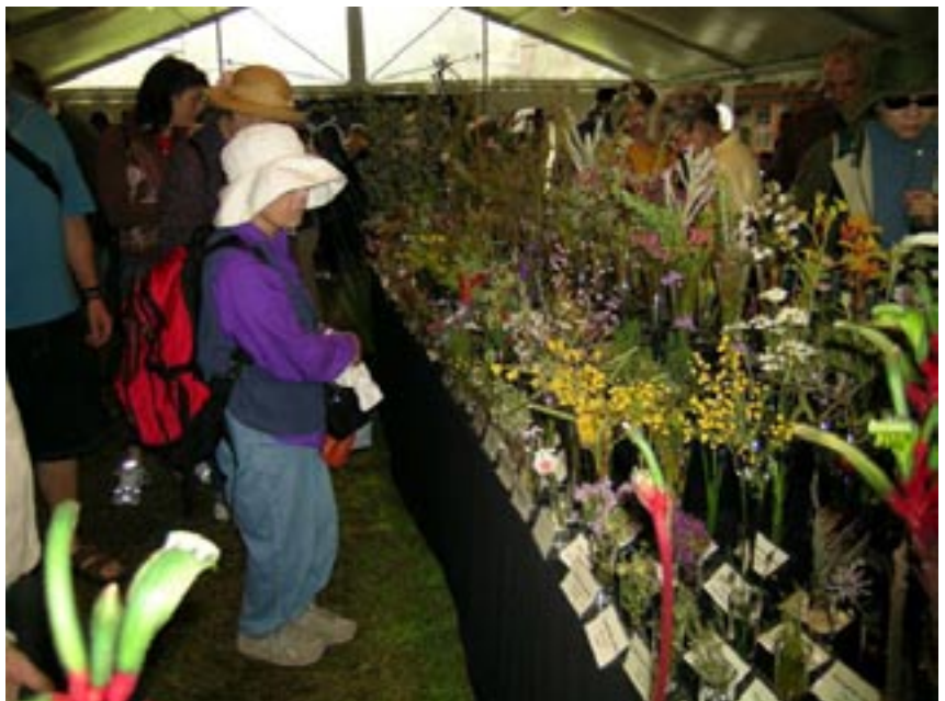
right: Names display at wildflower festival