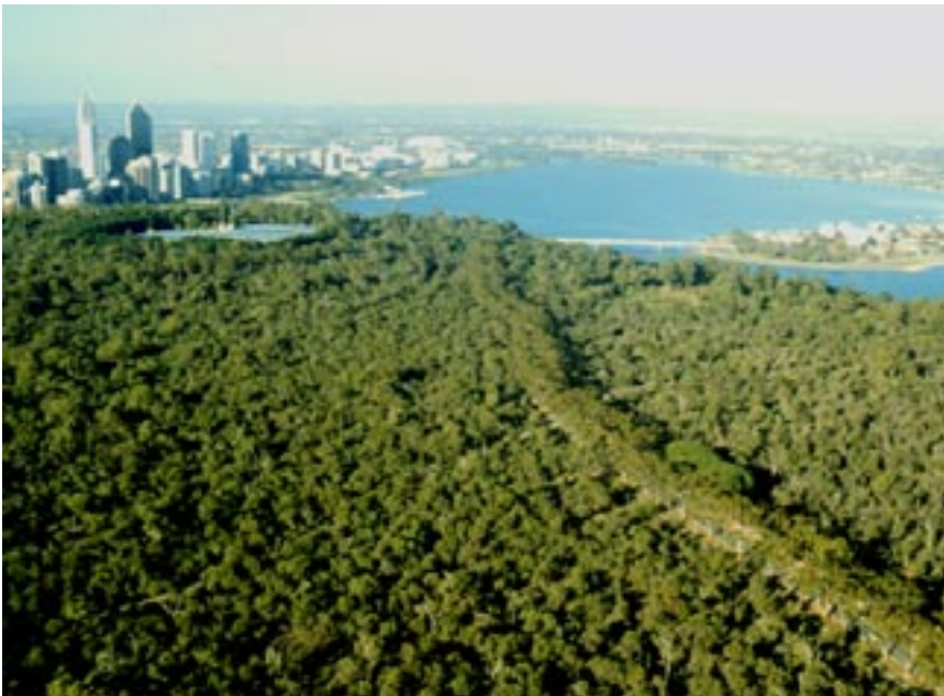
Aerial view of Kings Park bushland

Like many Western Australians, my earliest recollections of Kings Park and Botanic Garden include family picnics, racing sticks down streams, climbing over natural play equipment and having an understanding that this place was somehow very special. As I became older, my childhood recollections matured into an abiding affection for this Park with its sweeping vistas across manicured lawns to the river and city beyond; to the bushland with its natural display of local plants; the Botanic Garden with its focus on Western Australian plants; and the rich cultural heritage that encompasses Aboriginal and European history, and contemporary experience.