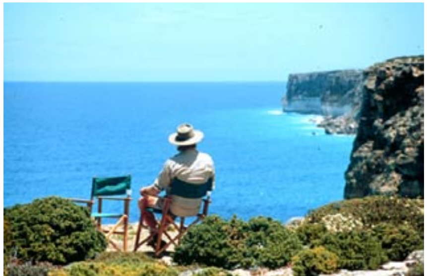
top right: Staff hard at work on plant collecting trip