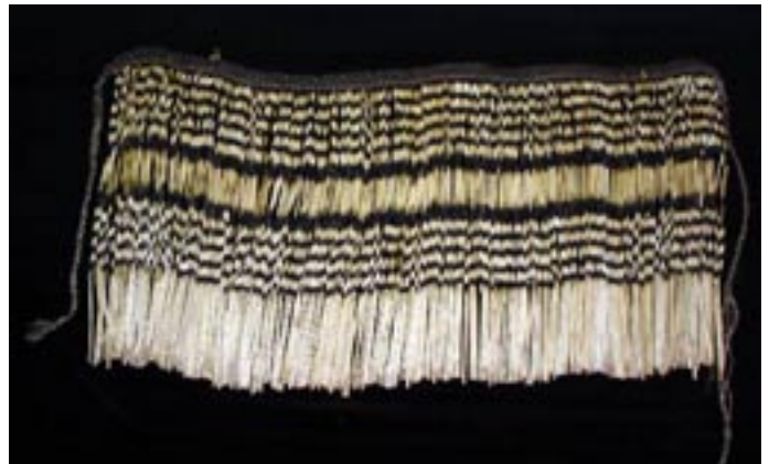
left to right : kete/basket, muka/string, whariki/ mat, piupiu/skirt.