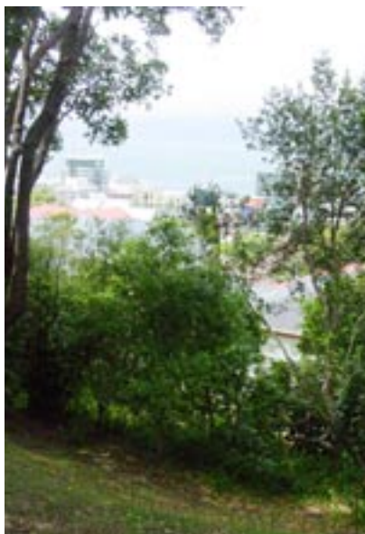
East Path: View shafts need to be constantly monitored and maintained.

Nevertheless the two are very closely intertwined and the success of one depends on the success of the other with the result that at times interpretive recommendations were made. The collections review will be an integral part of the findings and recommendations of the interpretive strategy.