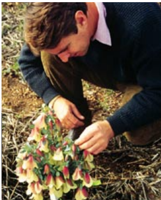
above: Plant breeding and development activities