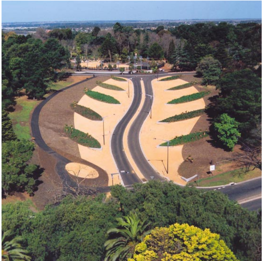
Geelong Botanic Gardens entrance