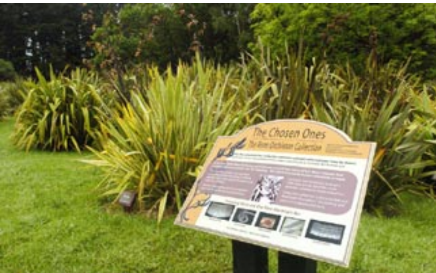
left: An interpretation panel recently installed at the collection.